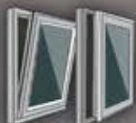
Tilt and Turn Windows