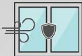
Resistance to Wind Load