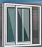
Sliding Windows and Doors